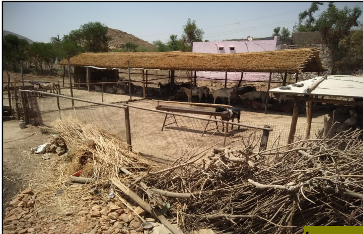
Improved Goat Shade

Thereupon, after getting well trained on goat rearing by SPECTRA , all SHGs women decided to develop their community based entrepreneurship along with the mentioned activities and chosen goat rearing as a base of the entrepreneurship. With the support of 30 SHG women and SPECTRA organization- SPECTRA Adarsh Utpadaka Mahila Producer Company Limited established in the year 2016. This entrepreneurship worked as a helping hand for this SHG women community, in breaking the gender stereotypes by taking a leading role in goat rearing business model, availing internal loan from their savings group and generating household income.