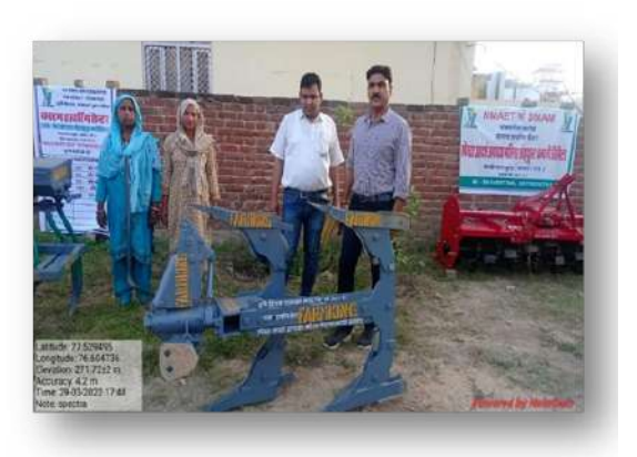
MB plough machine